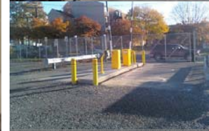
Crouse Hospital H & J Parking Lot Improvements