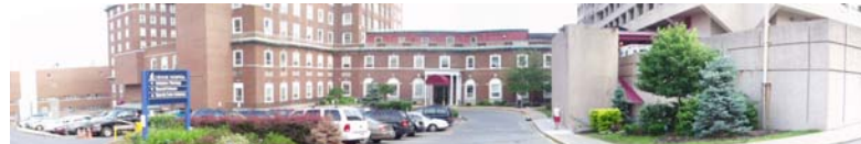
Crouse Hospital Phase 5 Surgical Expansion

Bryant Associates has also performed civil site design services for a garage rehabilitation project and three parking lot facility projects. Each parking facilities consisted of over 200 spaces with Kard-Key access, lighting and "Blue-Light" emergency service. Bryant provided Traffic studies, contract documents, construction management and inspection services. Bryant Also prepared and presented materials for City permitting and zoning variances.