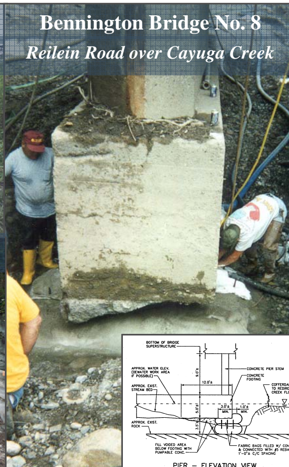
Bennington Bridge No. 8